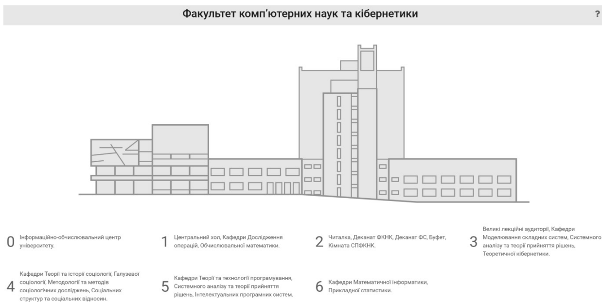
Figure 1. Faculty page example in implemented test prototype

Also, during development, it was noticed that it is inconvenient to use dynamically typed JavaScript, because typecasting caused errors that were difficult to find. It should be noted that the use of Bootstrap and React-Bootstrap introduced certain inconveniences due to the peculiarities of these libraries.