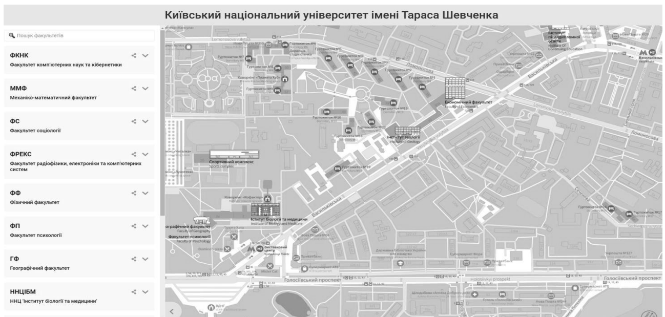
Figure 2. Web application home page

On the map, you can select objects that will be highlighted there and in the side menu (Fig. 2), where you can also select objects and they will be highlighted on the map. This is done to emphasize that the list and the map are linked structures. The list contains all structural buildings of the university, their abbreviated names, addresses, links to google maps and links to the website. Certain information is hidden from the user so as not to disturb him, and it can be viewed by clicking anywhere in the area about the structural unit.